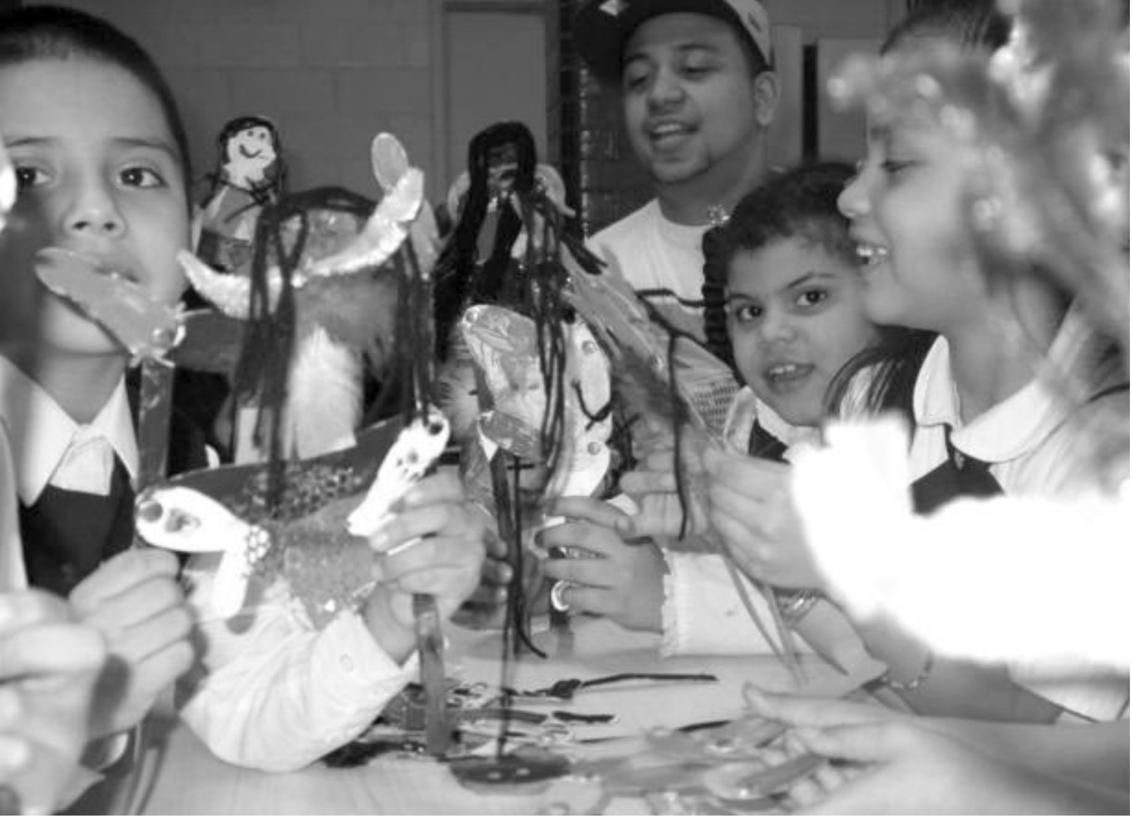
The Coalition for Hispanic Family Services Arts and Literacy Program

methods, rarely produces definitive results, but it does offer valuable ways to enter into the complexity of human situations, develop strong hypotheses, and bridge the qualitative-quantitative schism. Case studies are also essential tools for effective teaching and training, both areas of special importance for afterschool practitioners now that the field is developing its professional base. As used in the social sciences, in the evaluation of government programs, and more recently in education, the case study approach could prove to be a powerful tool in the study of afterschool contexts.