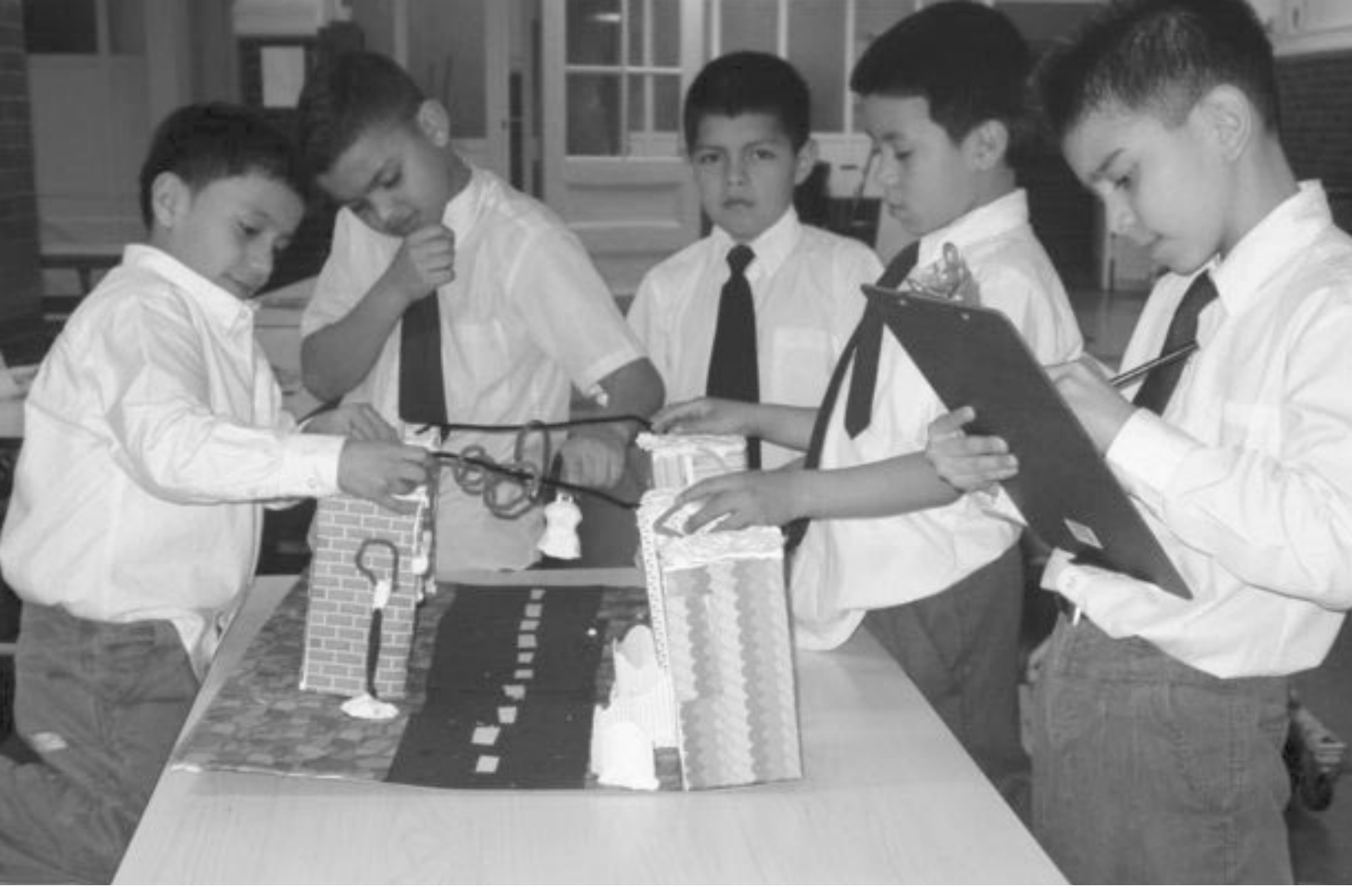
The Coalition for Hispanic Family Services Arts and Literacy Program

the kinds of afterschool activities that can foster the sense of affiliation immigrant youth need in order to engage in the life of a multifaceted and diverse community.