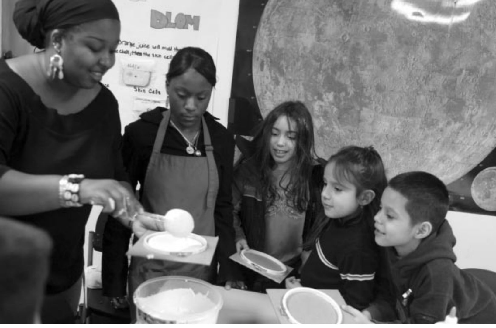
New York Hall of Science