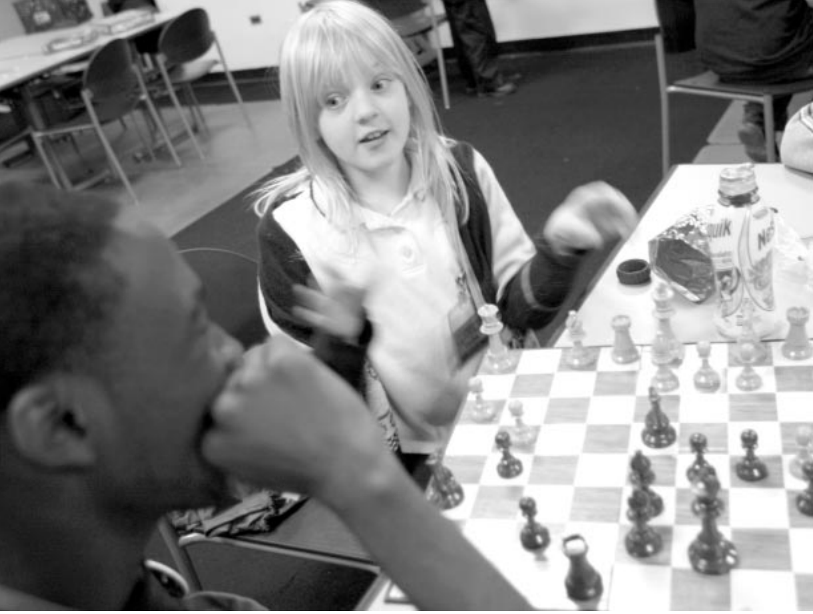
New York Hall of Science

responsible for collecting one type of data. For example, one researcher was responsible for conducting observations of all the sessions, another for collecting and analyzing the survey data, and a third for conducting the focus group interview. The number of sources, varying qualitative and quantitative formats of the data, and multiple researchers presented some challenges to analyzing the data in a way that would allow us to triangulate findings and to benefit from the perspectives of the various researchers. To address these challenges, we used a multi-step process. First, each researcher typed up his or her field notes from observations, interviews, and the focus group. These notes were shared among the researchers. Results from the pre- and post-participation student survey, the quantitative questions from the mentor feedback forms, and the teacher ratings of student competencies were summarized through frequencies, means, and cross tabulations; these results were then also shared.