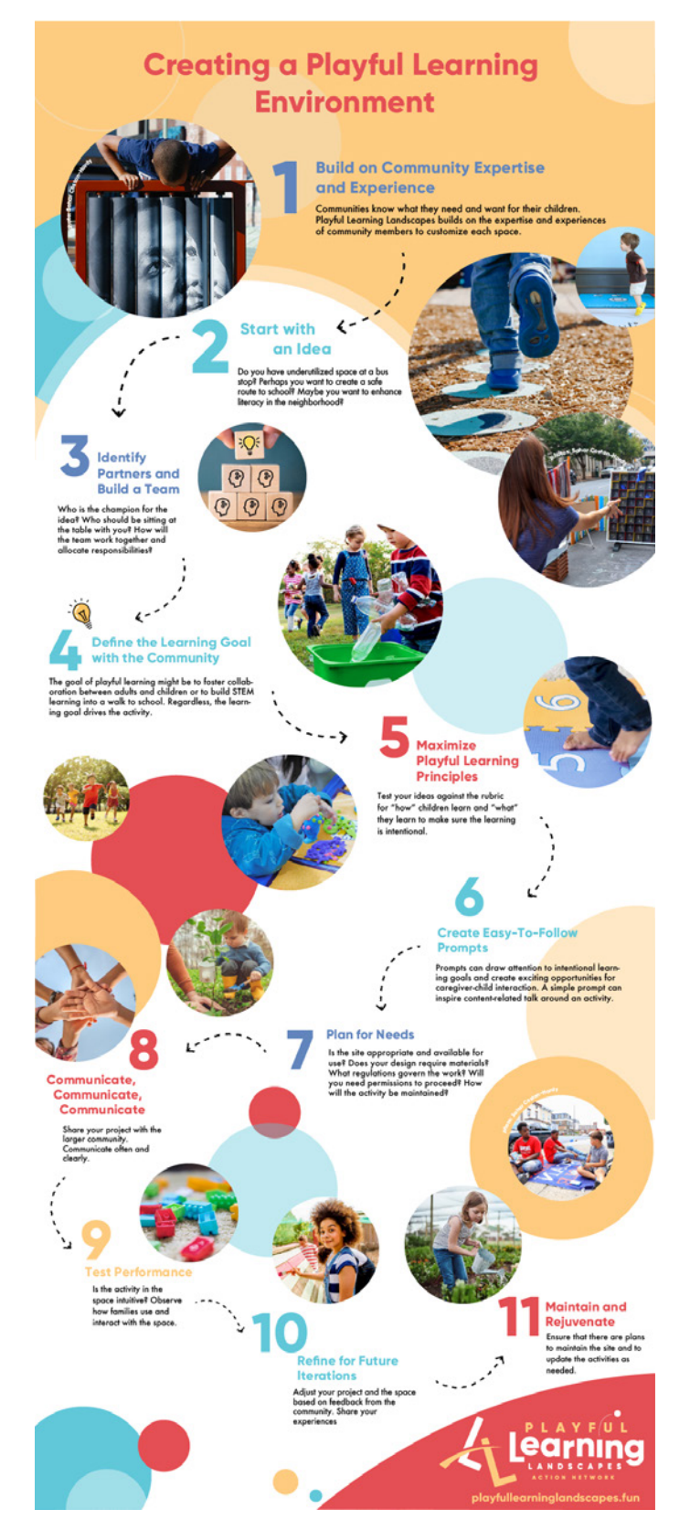
Figure 1. Creating a Playful Learning Environment in 11 Steps